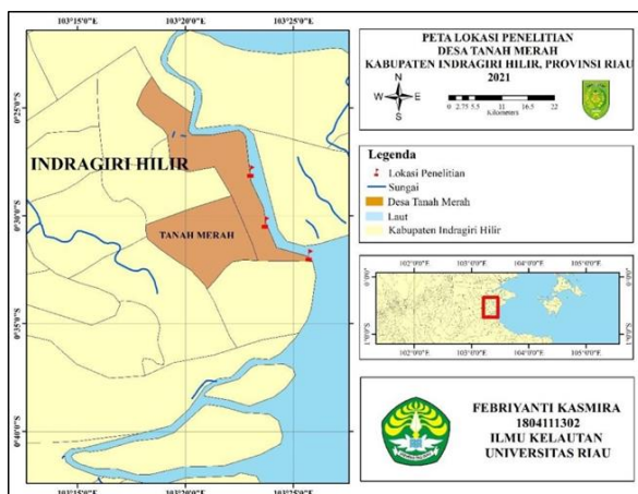
Figure 1. Map of research locations

This research was conducted in January 2022 in the coastal waters of Tanah Merah Village (Figure 1) and in the Marine Biology Laboratory and Marine Chemistry Laboratory of the Department of Marine Science, Universitas Riau.