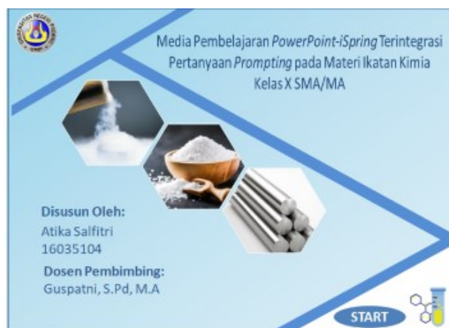
Figure 1. Example of electronic learning media (Salfitri & Guspatni, 2021)

media and 10 articles that discuss the results of the learning media effectiveness test.