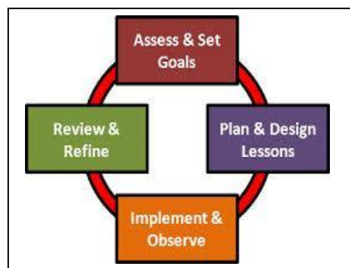
Figure 2. Lesson Study Cycle