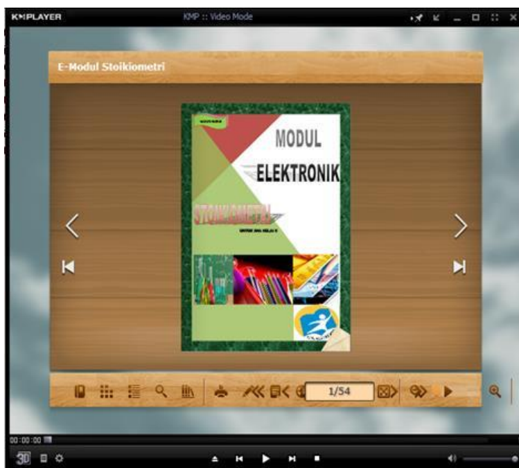
Figure 1. Initial Appearance of the Kvisoft Flipbook Maker-Based E-Module on Stoichiometry Material

Before implementing e-modules, researchers have developed a k-based e-module flipbook maker on stoichiometry material. The results obtained from the development of the e-module based on Kvisoft flipbook maker are e-modules that are valid and suitable for use in the learning process. The initial look / e-module cover of a valid Kvisoft flipbook maker can be seen in Figure 1.